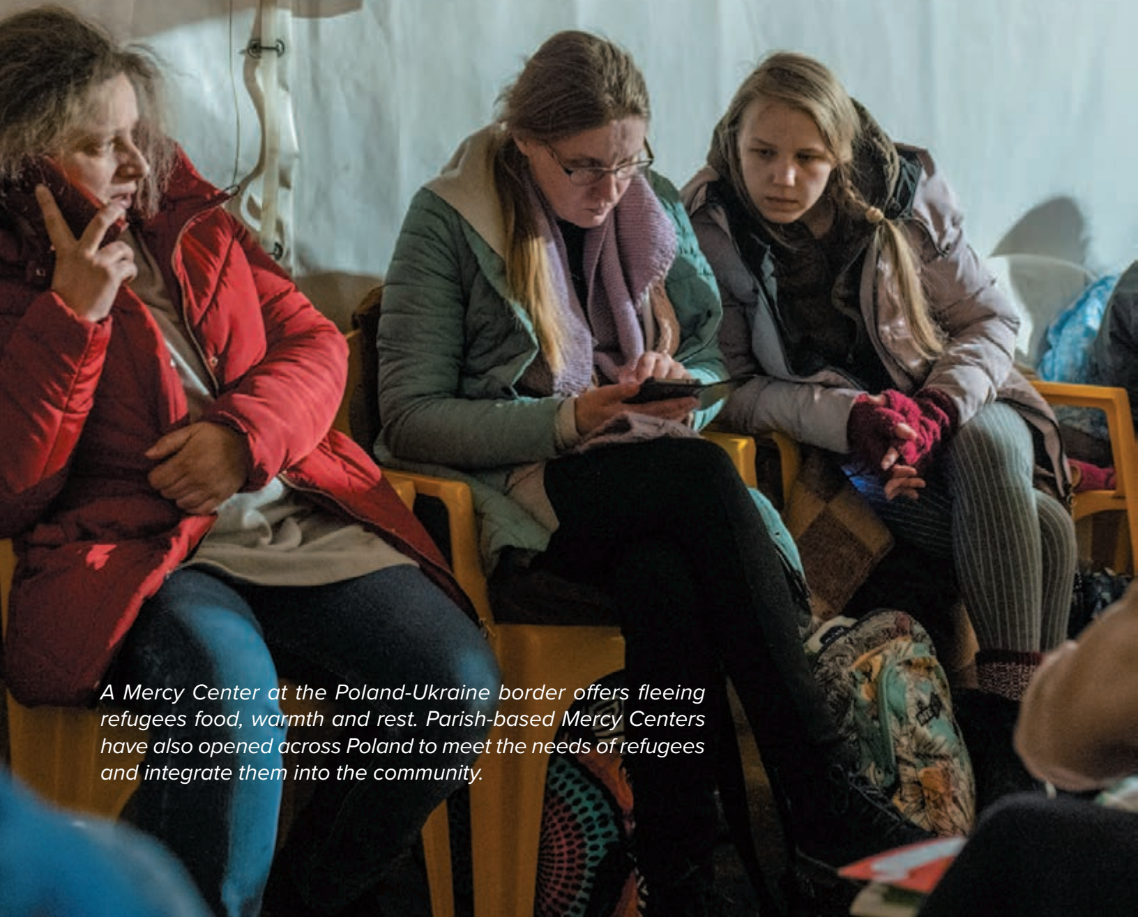
A Mercy Center at the Poland-Ukraine border offers fleeing refugees food, warmth and rest. Parish-based Mercy Centers have also opened across Poland to meet the needs of refugees and integrate them into the community.