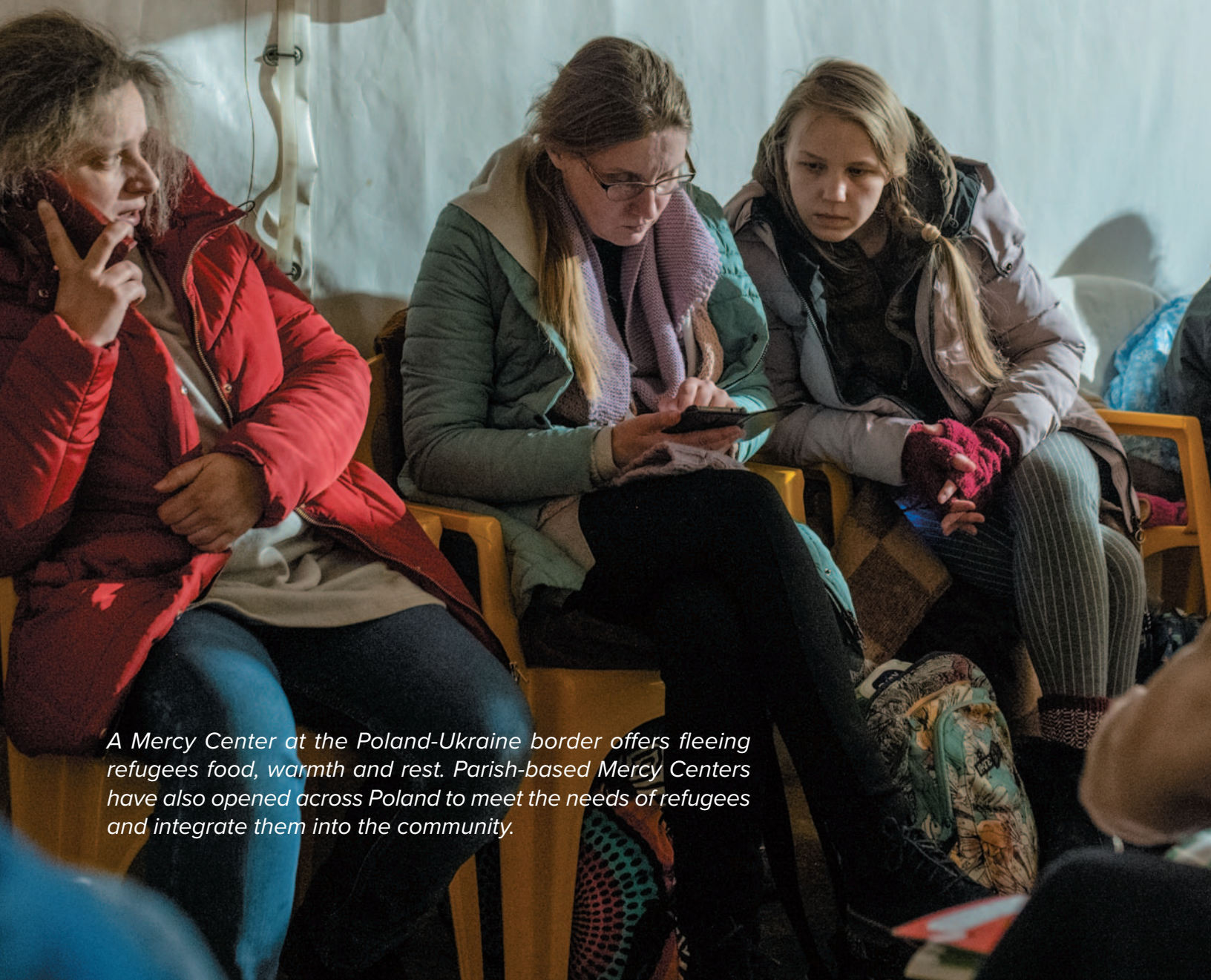
A Mercy Center at the Poland-Ukraine border offers fleeing refugees food, warmth and rest. Parish-based Mercy Centers have also opened across Poland to meet the needs of refugees and integrate them into the community.