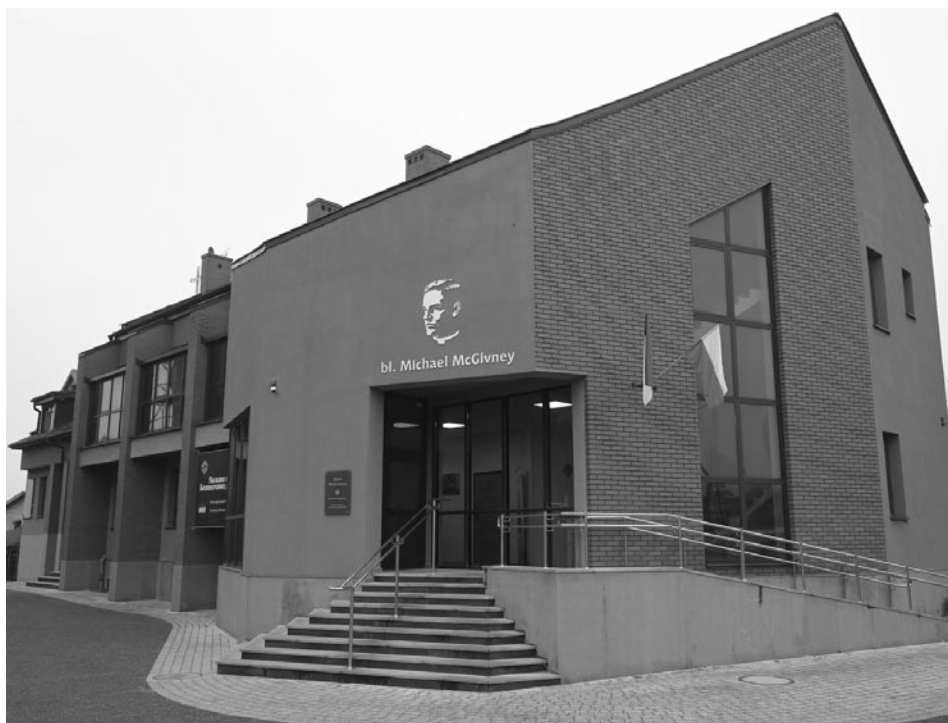
The new Blessed Michael McGivney House, with an image of the priest on the façade, serves Ukrainian refugees.