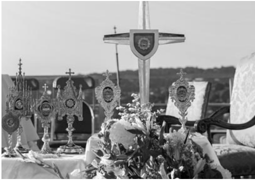
During the mountaintop Mass August 14 in Waterbury, Conn., reliquaries containing bone relics of Father McGivney were displayed and afterward were made available for veneration by the hundreds of attendees.

KNIGHTS OF COLUMBUS • 1 COLUMBUS PLAZA • NEW HAVEN, CT 06510-3326