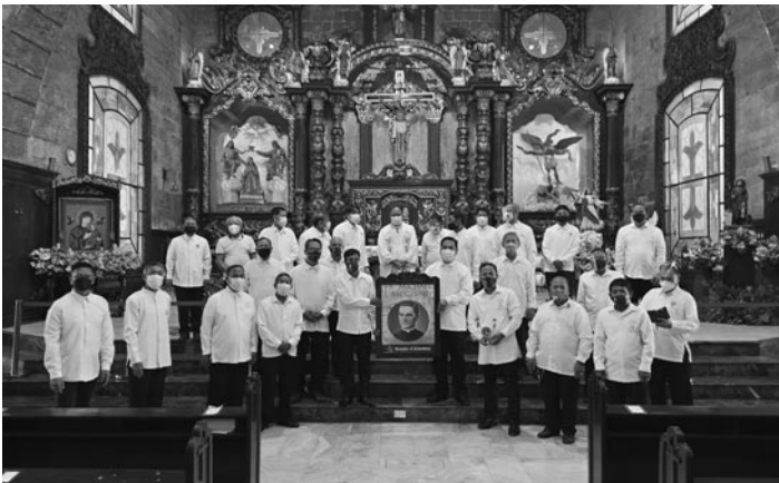
Knights of San Miguel de Marilao Council 8581 in Bulacan gather around a poster of Father McGivney after a feast-day Mass offered in San Miguel Arcángel Church.