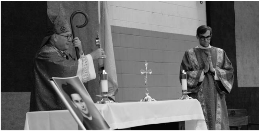
Holding a first-class relic of Blessed Michael McGivney, Cardinal Timothy Dolan of New York blesses congregants at Mass on the feast day held at St. Joseph's Seminary in Yonkers.