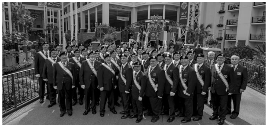
Fourth Degree Knights from Bienville Assembly, who served as honor guards for Masses and other events, pose at the Supreme Convention held at the Gaylord Opryland Hotel, Nashville.