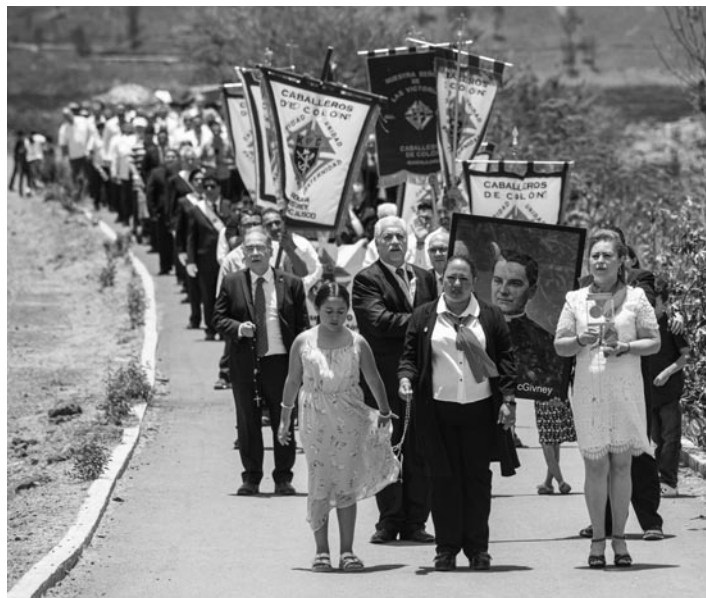
A national procession to the Shrine of the Martyrs of Christ the King in Guadalajara, Mexico, concluded with the installation of a portrait and relic of Blessed Michael McGivney.