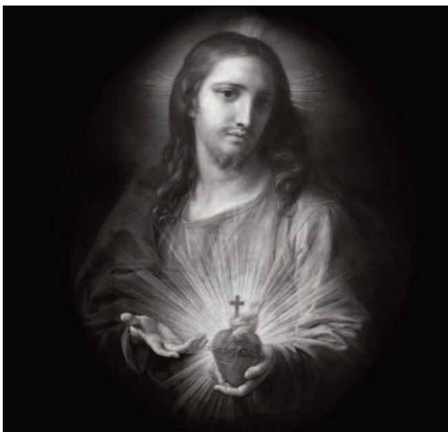
This popular image of the Sacred Heart will be brought on pilgrimage to councils throughout the Order.