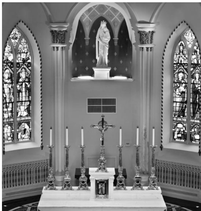
The chapel on Paca Street will serve men discerning a vocation.