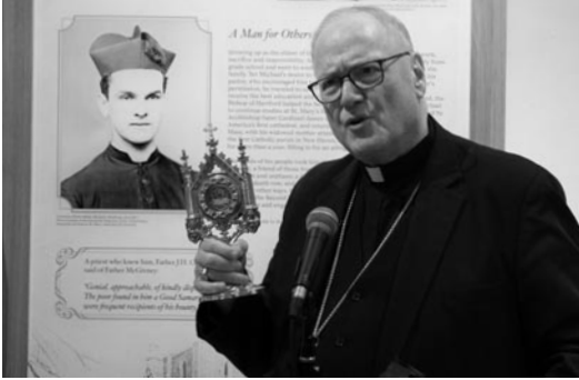
Holding a first-class relic to bless attendees, Cardinal Timothy Dolan of New York speaks at the opening of an exhibit titled "An American Blessed: Father McGivney, Founder of the Knights of Columbus," which debuted March 6 at the Sheen Center for Thought & Culture in Manhattan.