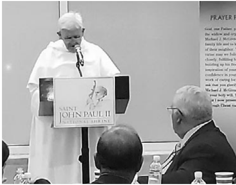
Father McGivney was honored at an event held at the Saint John Paul II National Shrine in Washington, D.C.

KNIGHTS OF COLUMBUS • 1 COLUMBUS PLAZA • NEW HAVEN, CT 06510-3326