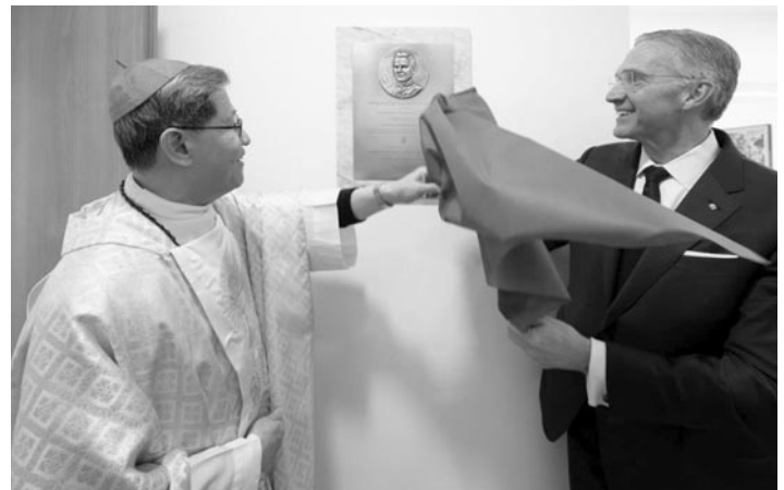
Cardinal Tagle and Supreme Knight Kelly unveil a plaque in the newly named Blessed Michael McGivney Library at the Rome school for continuing formation of Filipino priests.

After the celebration, Supreme Knight Kelly expressed his gratitude for the library being named for the Order's founder and prayed "that all the research in the world and, particularly, the research in this college will help you in your search for the face of [God]."