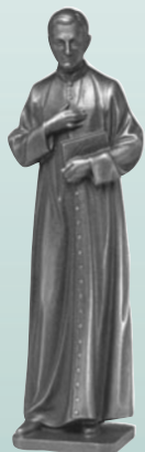
8" Figurine of Father McGivney Crafted by Italian sculptors. Depicts Father McGivney holding a book with the emblem of the Knights of Columbus embossed on the cover. This figurine can remind us of Father McGivney's presence in our lives and his role as intercessor for our needs. Available in fiberglass with a golden-bronze finish. $50 (Back in stock)