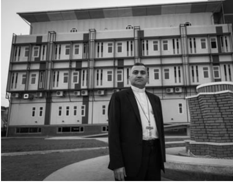
McGivney House, a 140-unit apartment building in Iraq, will provide housing for more than 110 families.

KNIGHTS OF COLUMBUS • 1 COLUMBUS PLAZA • NEW HAVEN, CT 06510-3326