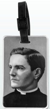
Luggage Tag Pick out your luggage at the airport with this distinctive tag. An image of Father McGivney on one side and spaces for your name and contact information on the other side. $5