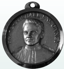
Father McGivney Medal This medal can be worn with a chain (not shown). 1" in diameter. Sterling Silver Medal: $25

COMPLETE AND RETURN TO THE FATHER MCGIVNEY GUILD, 1 COLUMBUS PLAZA, NEW HAVEN, CT 06510-3326. MAKE CHECK PAYABLE TO: FATHER MCGIVNEY GUILD. TAX-DEDUCTIBLE DONATIONS MAY ALSO BE SENT TO THIS ADDRESS. (You may write your prayer requests below.)